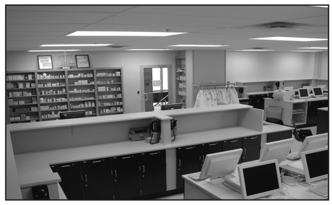
A view of the completed Pharm Care 2 lab complete with state-of-the art fixtures and computers.

As the new lab is initiated, other practices may be possible. Dr. Pray has explored the possibility of phone-to-phone calling, allowing students to call each other for "readings." At some time, it may be possible to incorporate some aspects of on-line insurance adjudication to allow students to become familiar with this maddening aspect of practice.