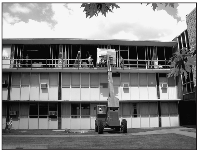
Workers prepare to install new energy-efficient windows and walls on the south side of the middle wing. Yes, it was completely open.