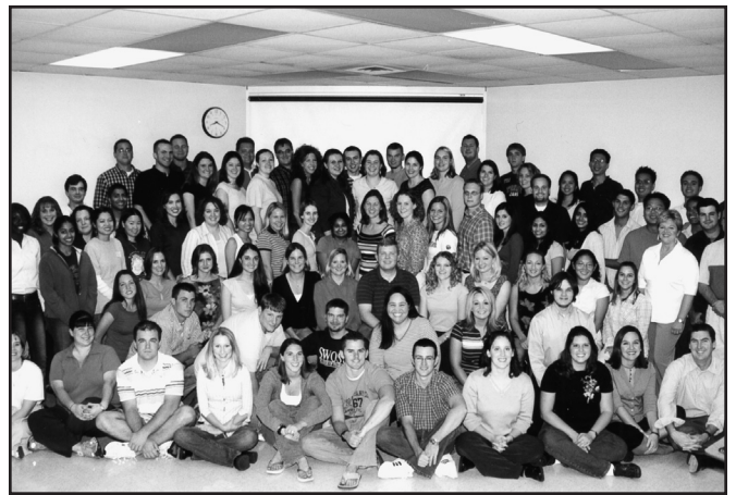
Buoyed by a new tidal wave of student involvement, SWPhA membership is at a modern era high. For the names, wait for the Spring 2005 issue of The Apothecary.