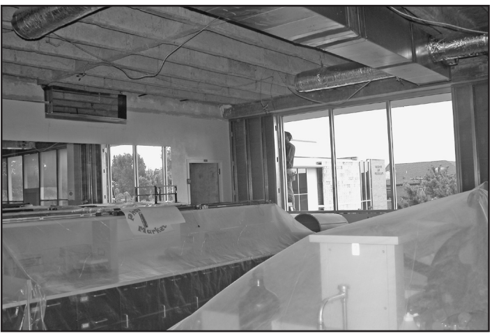
The new Pharm Care 1 lab is covered with plastic to protect it during the window and wall replacement.

You can view a movie of the remodeling procedure by going to the Movie Page at Dr. B French's website at: <u>http://faculty.swosu.edu/</u><u>benny.french/pages/movie.html</u>. Click on the "Pharm Care 2 Lab Remodeled" link. This is a QuickTime movie, and if you do not have the QuickTime movie player on your computer, you can download a free version through the indicated link at the top of the Movie Page.