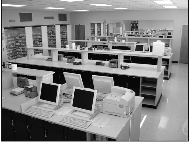
The completely remodeled Pharm Care 1 lab. This lab is the new version of the old Preps 1 or compounding lab.